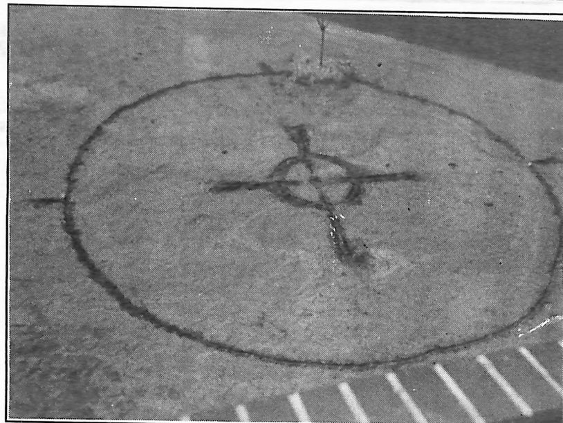
What is this?

As the Financial Aid Office is exploring the possibility of purchasing similar software, all students who use the program are asked to provide comments on a survey sheet attached to the profile form they complete. These comments will be used to help determine whether or not software will be purchased, and which particular program is considered "best."