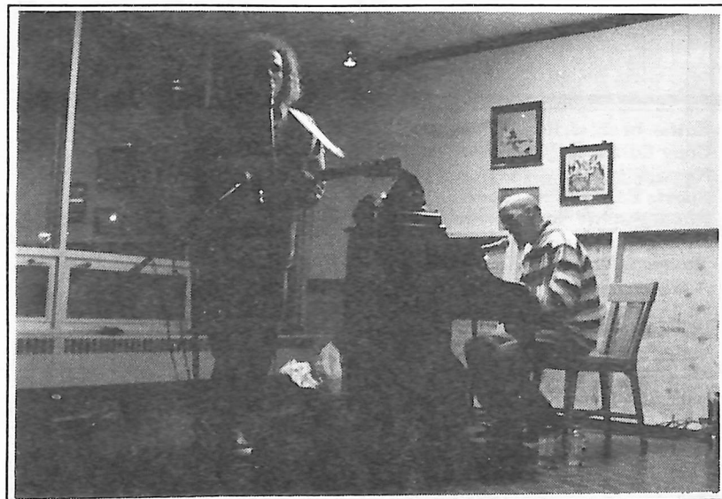
The Christian rock group Lost and Found performed in the Dragon's Head Wednesday night.

Students, faculty and staff were invited to stop by the public relations office to add words of encouragement in a book which was given to him before he left for the hospital.