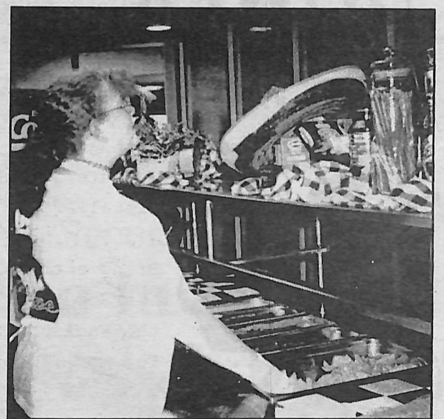
(above) The cafeteria has decided to get rid of the pasta/hamburger/hot dog bar and now is offering two meats and one vegetable in the second line.