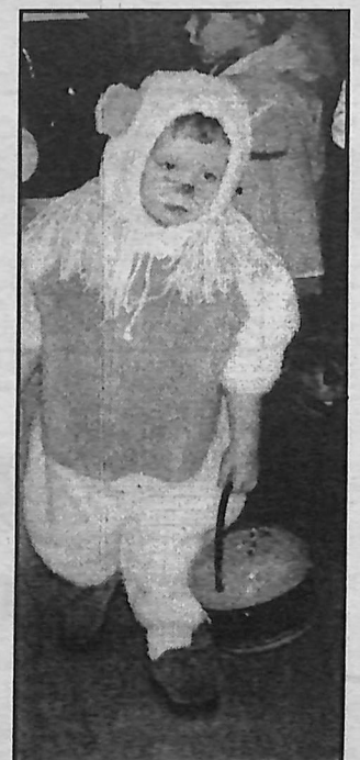
(right) A not to happy trick-or-treater parades the campus center after a long night of candy gathering. Students living on campus signed up to have trick-or-treaters come to their door to receive candy.