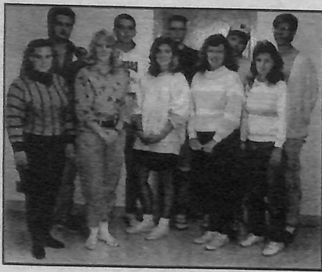
Guess what year the picture was taken... and win!!