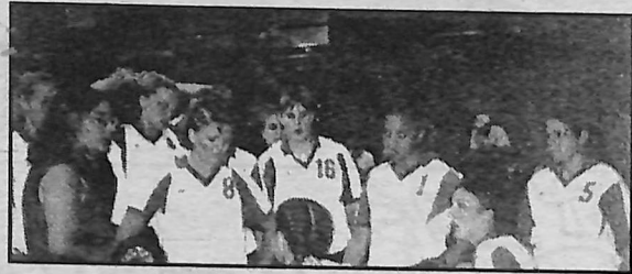
Volleyball Team betters record from a year ago