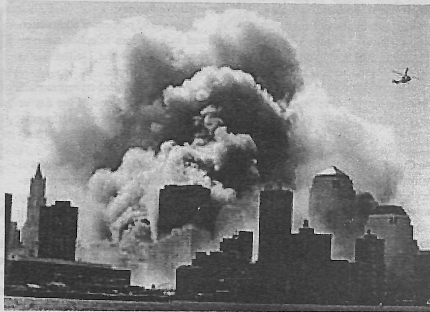
Attack on the Twin Towers. Rescue operations are still underway.