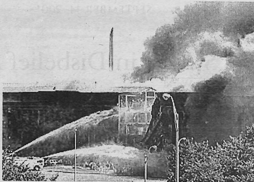
Part of the collapsed roof on the Pentagon, as firefighters douse flames.

Working on intelligence reports, the U.S. government is looking to the possibility that Saudi fugitive Osama bin Laden is connected to the attacks. He was implicated previously in the 1993