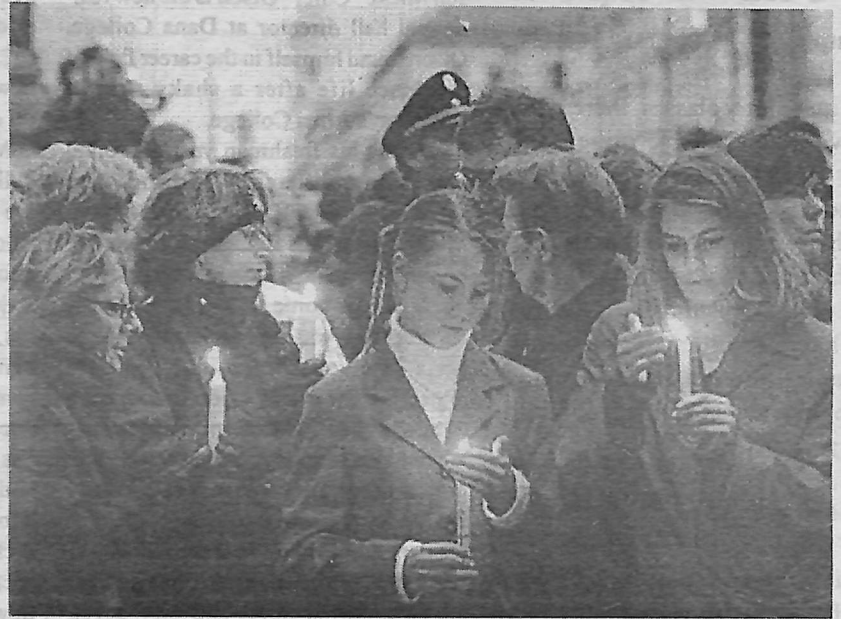
Loss felt around the world as other countries show their support by holding candlelight vigils.

"You just don't expect something like that to happen to civilians," he said, "Evil can strike at any time, so you have to be prepared."