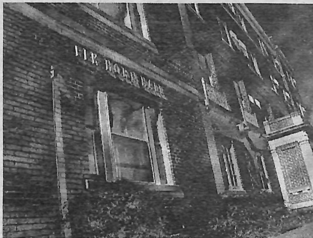
Unusual, unpleasant things happen in Elkhorn Hall.