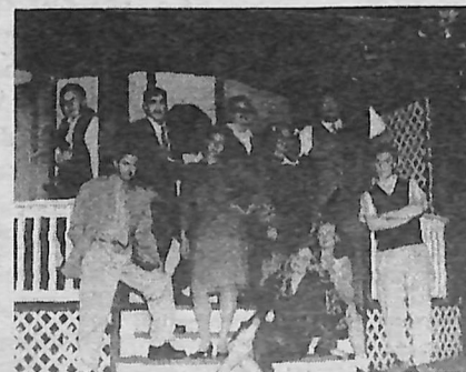
"A Clearing in the Woods" cast.

"A Clearing in the Woods" was beautifully produced, showing off the skill of the students. The play was a great choice, and I look forward to productions in the future that, hopefully, are just as thought-provoking and deep as this one was.