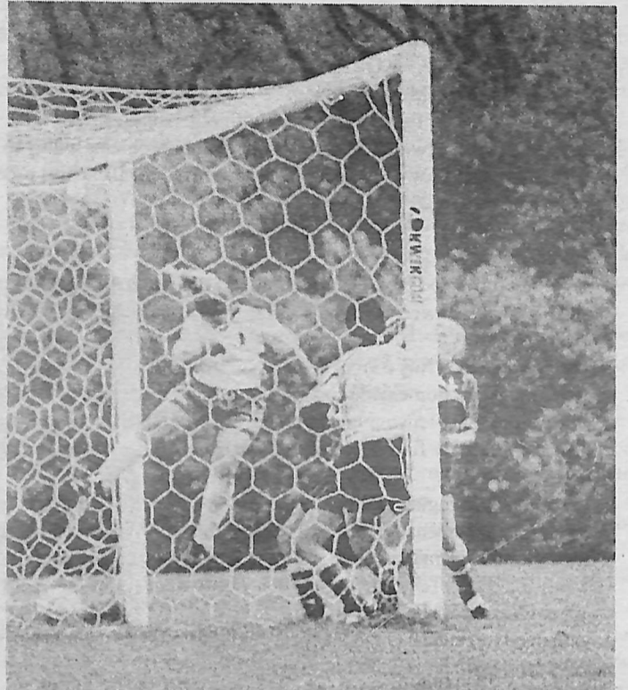
The Lady Vikes will begin conference play Tuesday, Oct. 30.

Because this is a playoff game, tickets are required. There will be 150 free tickets given out to students, who must show student identification to get their one ticket. Students without free tickets will be charged $2. Nonstudent adults will be charged $5.