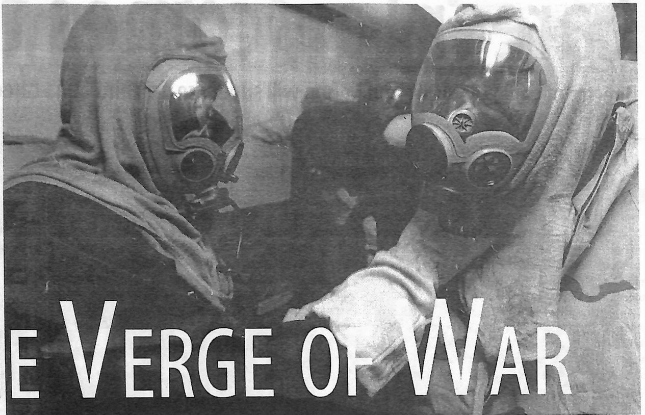
Sailors on the USS Anzio practice using their MCU-2P gas mask during a recent chemical, biological, radiological drill. The USS Anzio is currently operating in the Mediterranean Sea.

Inside the chambers of the United Nations Security Council, a decision affecting the world and the strength of the U.N. will take place this week. Four nations advocate a strong response to Iraq's insubordination, verging on war, while other nations oppose.