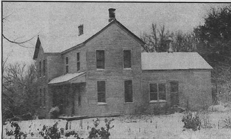
The home of Edward Gein the inspiration behind Leatherface of The Texas Chainsaw Massacre.

Edward Gein was arrested in 1957 when police in Plainfield, Wisconsin were inspecting his farmhouse for the murder of a woman from the town. The officers searched Gein's house, and found more than they were looking for. The woman's decapitated body was found, hanging upside down from the rafters, her torso split by a