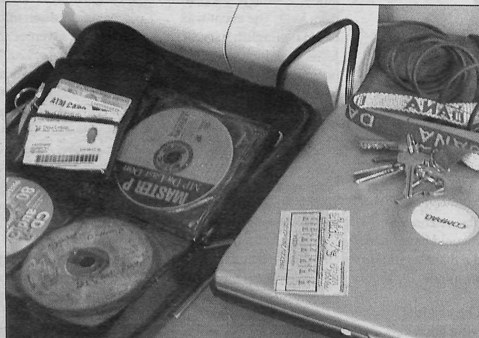
As theft become more common on campus, students are encouraged to keep their dorm doors locked at all times.

In every case of larceny, the victims' rooms were left unlocked.