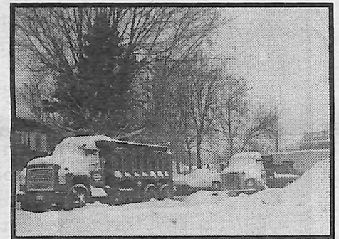
Clockwise from left: road conditions prove hazardous; snow piles up from plows in front of Wal-Mart; driving conditions are made worse by snow covering vehicles.

you run into the snow banks. Many corners have become dangerous because you can't see over the snow banks to see if there is any traffic coming or not. Many inch their way out carefully and slowly while others just go in hopes of no traffic coming.