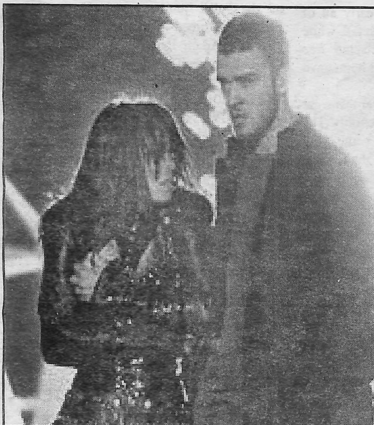
Janet Jackson bares all with Justin Timberlake at the 2004 Superbowl half time show.

Everyone keeps wondering why there is such a fuss over this incident when there have been things just as bad on other shows and even cable. For one thing, people did not tune in