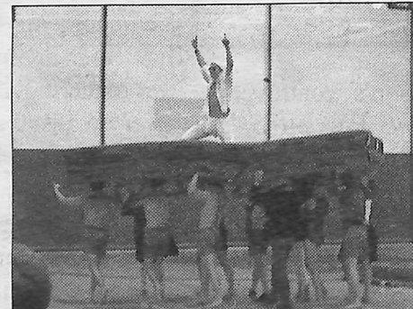
Above: Ladies and Gentlemen, Elvis has left the building. The team showed their sense of humor.