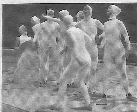
Above: The team performs The Ugly duckling. Right: One gymnast vaults into the air for the crowd.

This was yet another cultural experience offered by Dana to not only students but to everyone in the surrounding community. Dana College itself, as you may know, has ties to the Denmark. The institution was founded by Danish pioneers. Is it any surprise, then, that we would continue out friendly relations with the Danish? For years to come, we can hope to experience more Danish culture – from crafts to backwards flips.