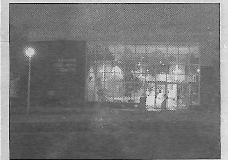
Some buildings on campus are rumored to have extra inhabitants like the no longer used (clockwise) Elkhorn hall, C.A. Dana Hall of Science, and the Madsen Fine Arts Center.

in the empty theater. These are just the stories provided about Dana. It seems many other schools are having haunted experiences too, like Curtis College.