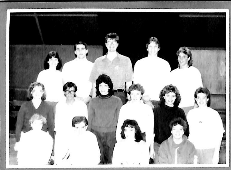
EK joins together for its final group picture.