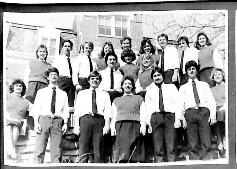
The Dana College New Day poses before Old Main.