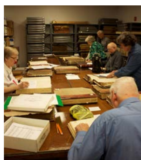
Volunteer week, Oct 2011