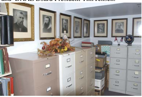
The Dana College room lined with portraits of former Dana presidents.