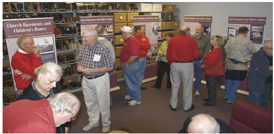
Dana College Alumni Enjoy Kringle Mingle at the Archive Grand-Reopening Event