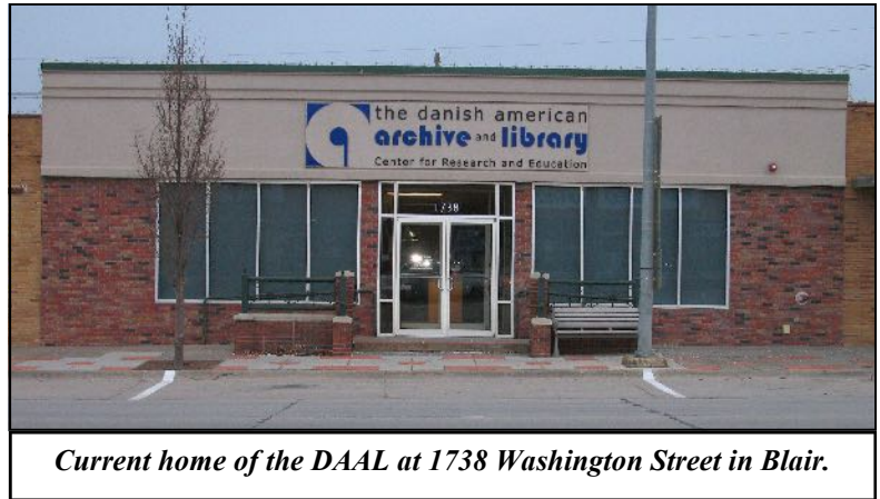
Current home of the DAAL at 1738 Washington Street in Blair.