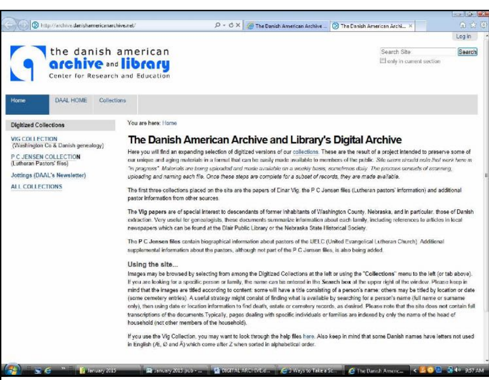
Opening page of the digital archive accessed from the DAAL website home page.