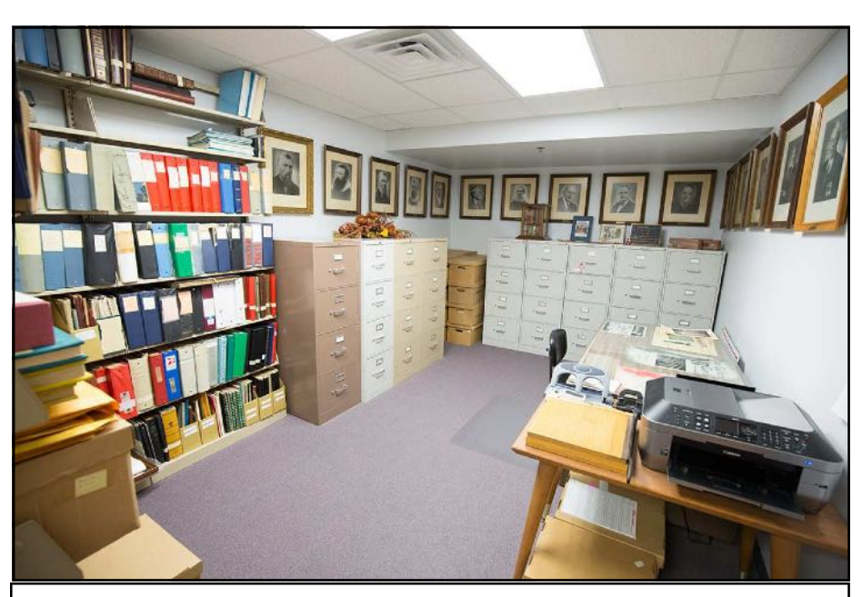
The Dana Room, located in the center of the DAAL, contains tens of thousands of documents. The goal is to eventually eliminate all the duplicates and digitize the collection.

With the purchase of our building at 1738 Washington Street in Blair, staff and volunteers can finally turn their full attention to the actual business of accessioning, sorting and cataloging the priceless materials that continue to come in the door. One of our first priorities is to go through all the collections to eliminate duplicates and materials that don't apply to Danish American history. For example, the Dana College collection contains thousands of duplicate minutes of meetings. If six people attended a faculty meeting or a faculty senate meeting, we have six sets of minutes. And this is true of meetings of every sort from board of regents to student senate meetings.