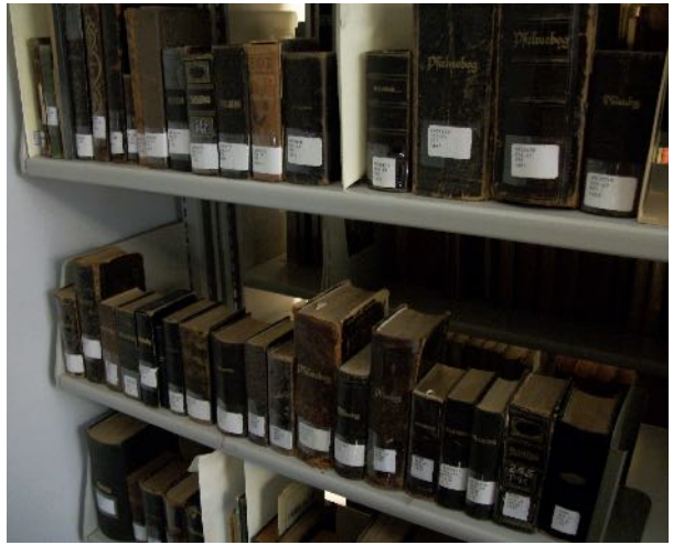
The Danish psalmebøger currently occupy one section of shelving on the library side of the DAAL.

When the Danish American Archive and Library moved into our present location, we brought along box after box of uncounted Danish language hymnals. Most of these were small (4" to 7" high) books published from the 1860's until the 1960's. Called psalmebøger or salmebøger in Danish, they were a ubiquitous part of every church-going Dane's life. Most families had more than one copy if not one for every member. They were from a couple hundred pages to more than a thousand depending on hymn supplements or appendices ( tillæg ). Some editions contain the readings for the Sundays of the church year and various liturgical services, and before World War I they were printed in the old Gothic script. They were published in Denmark by various publishing houses and in the United States they were distributed in large numbers by the Danish Lutheran Publishing House in Blair.