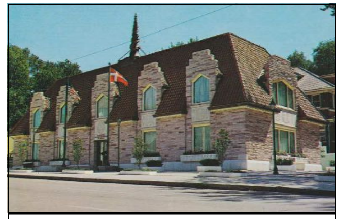
The former headquarters building of the Danish Brotherhood in America.

The building served as law offices from 1994 until 2015, when it was purchased by Security State Bank as future administrative space for Dundee Bank. AO, an Omaha architectural firm, is doing the architectural work on the property and hired Restoration Exchange to write the nomination. You can see the entire nomination document at: landmark.cityofomaha.org/images, then click on National Register.