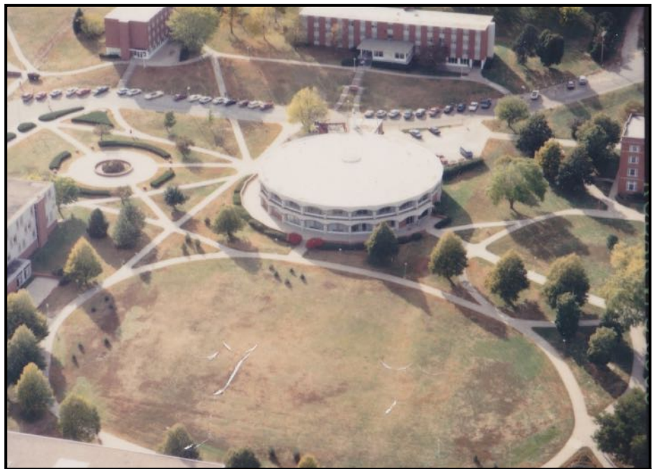
Dana's own "Unter den Linden" surrounding the campus oval.

This article, now updated by the same writer, appeared in the Spring 2006 issue of the Dana Review, the alumni magazine.