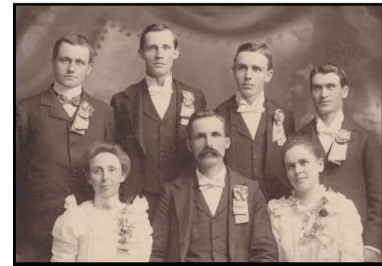
Unidentified: Danish? Lutheran? Confirmation?

There was a time before the Archive left Dana College when many volunteers spent their time looking at countless unidentified photos that had accumulated at the school or in the old church synod. Many faces were remembered and many forgotten, but there were some successes. The properly labeled photographs entered a new life as part of boxed