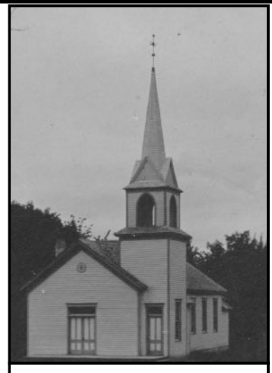
Original Danish Evangelical Lutheran Lazarus Church.

DAAL Danish American Archive and Library Dedication to our Ancestors, Appreciation of their Labors