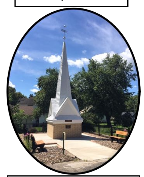
Member memorial of First Lutheran Church in Pov Sippi, Wisconsin.