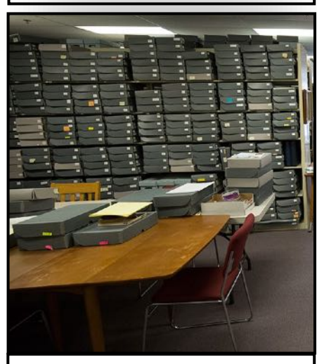
The "bricks" of the DAAL.