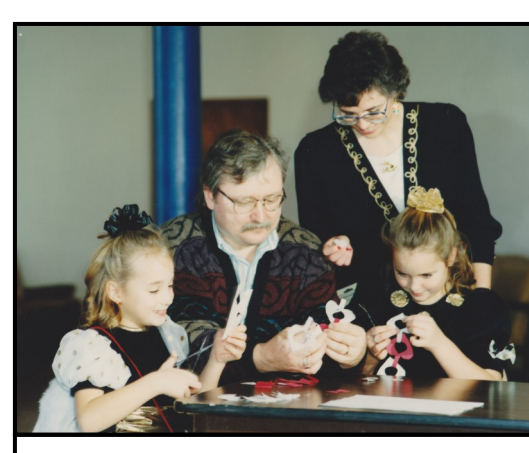
A family learns to make traditional Danish Christmas ornaments at "Let's Make It Danish."

It's apparent from the clipping that the college had been inviting the public to earlier Christmas programs, to its "Christmas Open House." Those programs had featured concerts by the Dana Choir and Concert Band; they'd also included, at various times over the years, a Santa Lucia