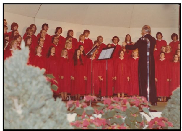
The concert by the Dana College Chorale was a highlight of the event each year.

Contributors to this success, in addition to members of the various campus performing groups, included the many students and members of the faculty and staff and their families, who, beforehand, helped plan the activities, decorated, and baked, and then assisted throughout the day.