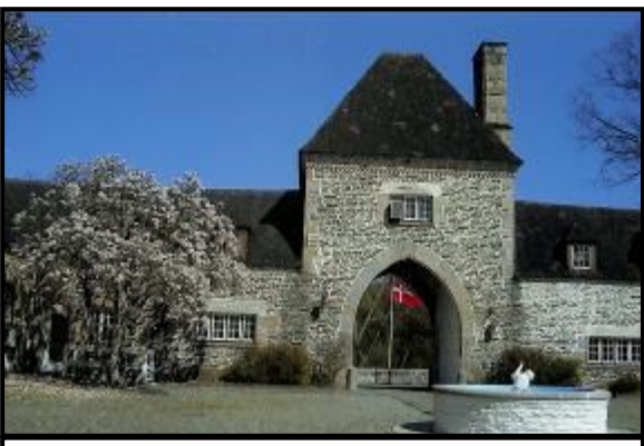
Main building entrance, courtyard and fountain at Croton-on-Hudson.