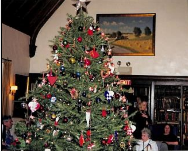
Christmas in the library.

or those born within the United States to Danish parents." The house was located on 41st Street in Brooklyn. In the 1920s