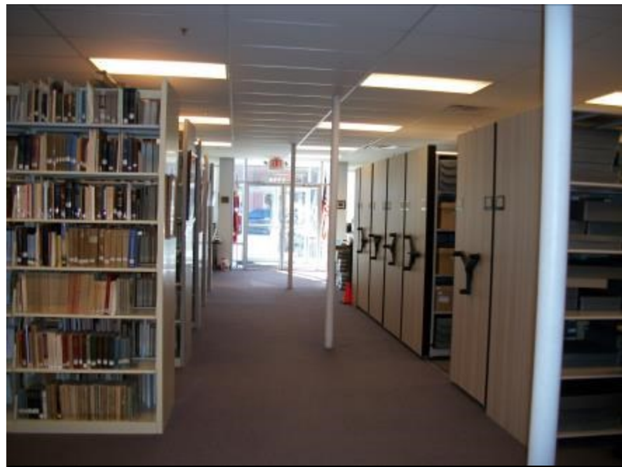
After: So much better! Room to spare.

We hope the danger of the pandemic will lessen in 2022. The Spring volunteer week has not been scheduled yet. Please let us know if you would like it to be a certain week to fit into your schedule. We anticipate having at least one Dana