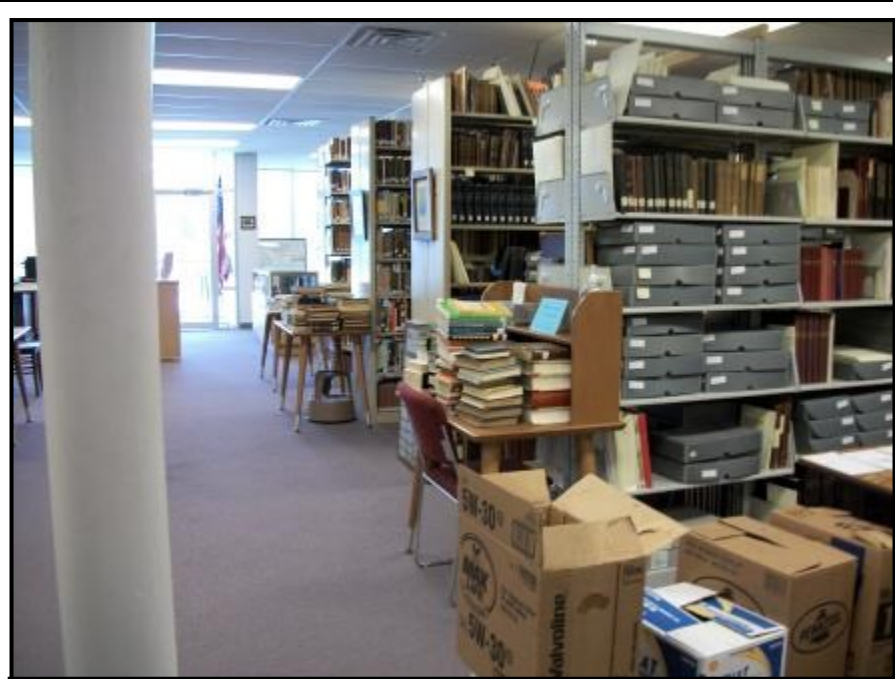
Before: Obviously we needed more shelf space.

see a lot of empty shelves since we expanded our capacity by a third. However, we have needed most of that extra space to integrate new acquisitions, to leave some space within the stacks, and to move materials off the floor and away from the ceiling. In 2021 we