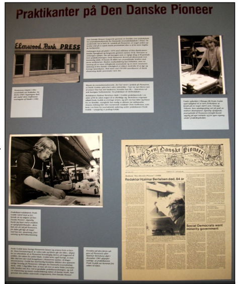
One of the panels from the exhibit The Danish Pioneer: 125 Years in Words and Pictures

It wasn't until the 1870s that large numbers of Danes began coming to North America. The Danish Pioneer began at that time as a newspaper to keep these newcomers informed about the wider world. As the decades passed the paper became a connecting link between various Danish American organizations and social groups, rather than a paper for Danish-speaking immigrants. Today the paper is primarily in English, but it remains a resource for all those interested in Danish culture and heritage on both sides of the Atlantic.