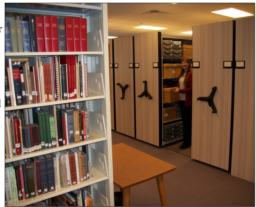
Library shelving on the left with Jill in the new archive shelving on the right..

The interior of the DAAL now has the library on the east side with the books on one-sided shelving and the archival boxes on the new movable shelves on the west side. If necessary the movable section could be expanded in the future. This new configuration allowed us to create more flexible and open workstations to accommodate our varying numbers of workers and researchers on different days of the week. The extra shelving has also allowed us to tidy up the offices, store