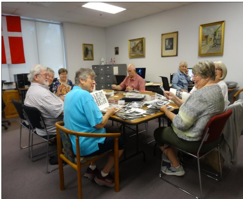
Dana College friends and alumni identifying photographs during Dana Volunteer Days June 18-20, 2024

* To learn more about Catrine’s internship, visit our website danishamericanarchive.org . An article can be found under Jottings newsletter/ January 2021. The completed online exhibit project can be found on the Links page at “The Dana College Theater Troupe Tour of 1942”.