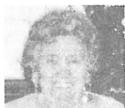
by Dagmar Jensen

1 1/2 lb. beef or pork liver 1 tsp. salt 3 slices of french bread 6-7 slices of bacon 2/3 cup milk 5-6 anchovies 4 small onions 2/3 cup cream 2-3 eggs 1/2 tsp. flour pinch of pepper, allspice and timian