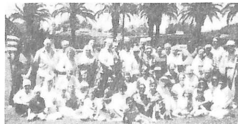
Sixty-five people enjoyed the fantastic annual picnic.