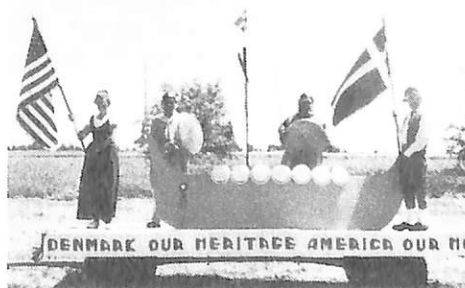
Our float for the centennial parade was a huge success.

Lodge #161, Ruskin, NE — Ruskin celebrated its centennial on June 13-14 and we