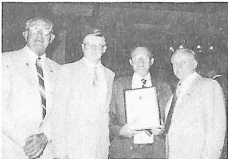
Members of the National Board of Directors congratulate Midwest District Past President for the 1986 Best District National President's Awards.