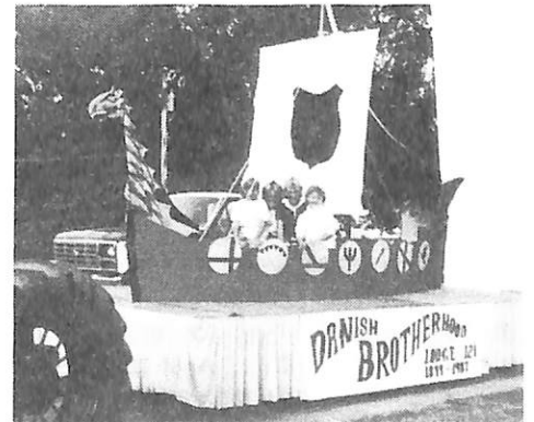
Our Viking ship floated down the streets of Tyler.

Lodge #121, Tyler, MN — At our June meeting it was discussed if we should attempt to build a float for Tyler's centennial. A group of enthusiastic members said it could be done. They decided to build a Viking ship complete with trimmings and four little Danish girls dressed in Danish costumes to ride in the float. After three sessions of work the job was completed.