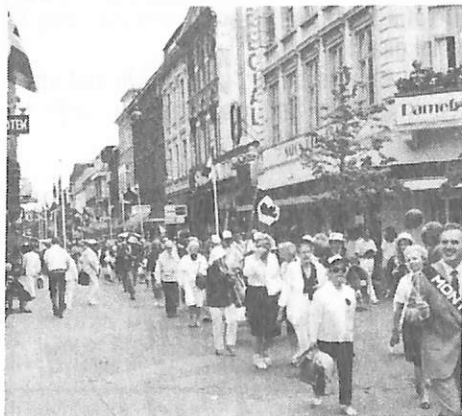
Conference participants in the Danish Canadian Parade in Kolding, on Canada Day on July 1, 1987.

Over 250 people participated in the Canada Day Parade in Kolding, Denmark, on July 1. The parade was led by fife and drummers from The Royal Danish Guards in their traditional uniforms with bearskins. Then followed the many standardbearers with their Danish and Canadian flags. Club flags and colorful provincial flags were also represented.