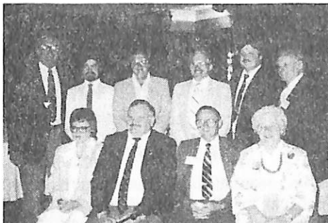
Congratulations to the new Midwest District officers.