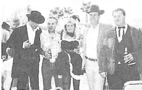
Friday night's western theme was a huge success.

get to the airport on the day following the convention. Kodan members, you can be proud of your super talented committee. They did an outstanding job and worked to the max and beyond to make this a "class" convention.