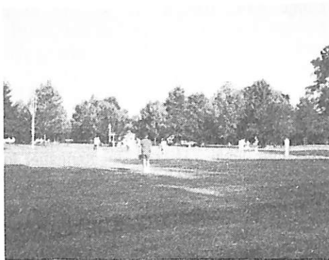
A softball game was thoroughly enjoyed at the picnic.