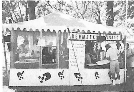
Our booth attracted many visitors.