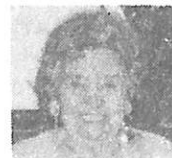
by Dagmar Jensen

1 large celery root 1 egg 1 lb. round steak (ground) 4 tablespoons flour 1 small onion (chopped fine) 1 cup water