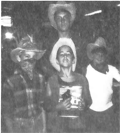
The Young Vikings are ready for a rootin' tootin' good time.

Lodge #345, Orange County, CA — On August 8 we celebrated our 10th anniversary. Everyone seemed to be in a festive