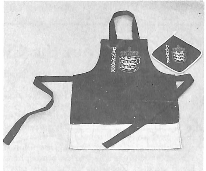
Apron & Potholder - Actual color: Red with white trim Actual apron size: 38 inches in length

Yes, I would like to order _____ "Danmark" sets and have enclosed my check in the amount of _____.