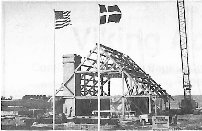
The Danish Immigrant Museum December 4, 1992.