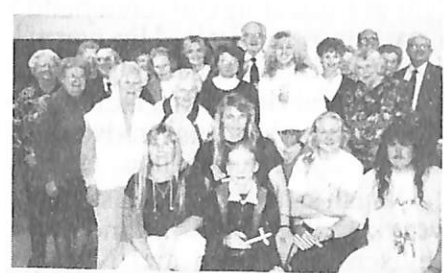
Attendees at Lodge No. 36's 103rd anniversary celebration.