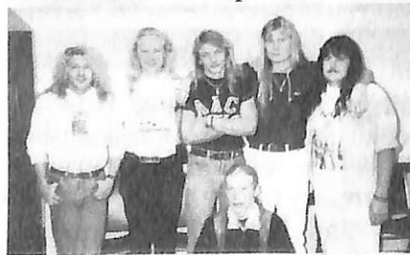
Danish rock group, Jackal, with Illinois record producer.