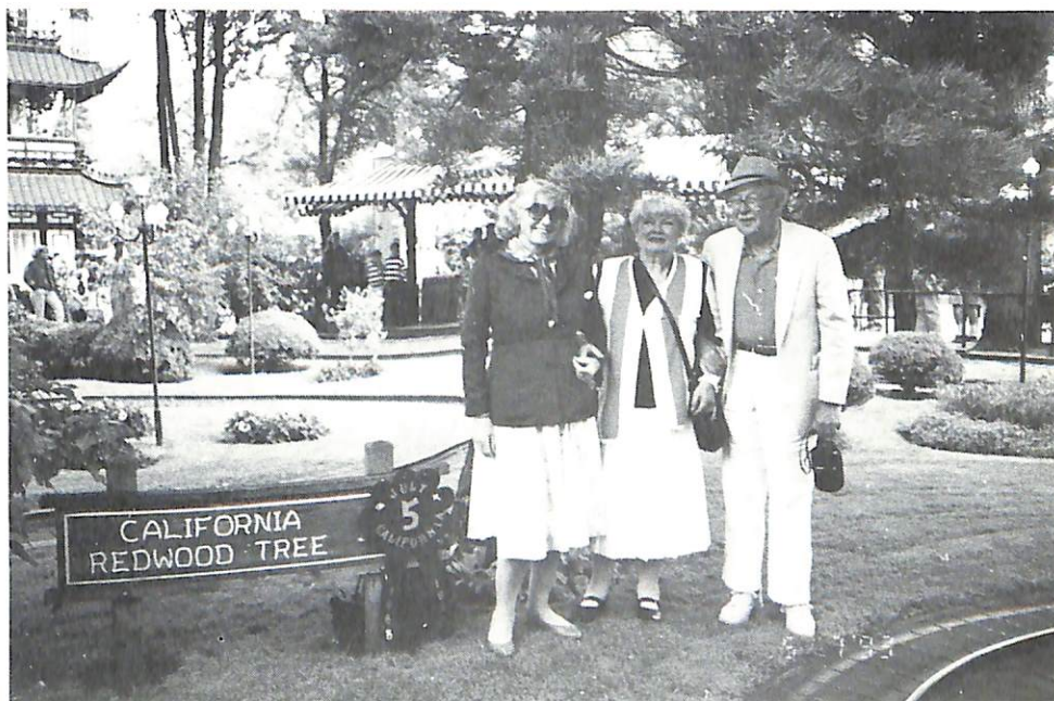
Tourist visit the Redwood tree in Tivoli Garden.

On July 4th of that year a group gathered in Tivoli Garden for the 125th anniversary celebration. The California-Nevada District presented Tivoli with a gift of a little Redwood tree from California. It was planted during a beautiful