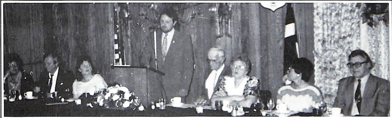
Lodge leaders at the head table.

Coming Together--A Beginning Keeping Together--Progress Working Together--Success