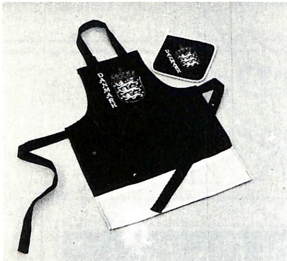
Apron & Potholder - Actual color: Red with white trim. Actual apron size: 38 inches in length.

This apron and potholder set are perfect for the Danish cook. The set is on sale to members for $25.20 and $29.20 for non-members. The items can be purchased separately too.