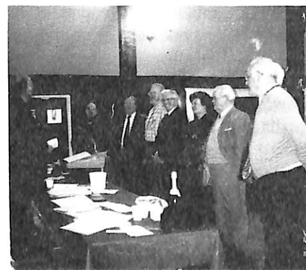
Installation of 1994 officers.