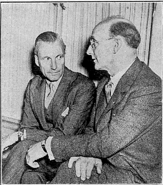
Henrik De Kauffmann

OFFICIAL PUBLICATION OF THE DANISH BROTHERHOOD IN AMERICA