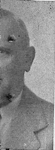
OWN oh, my!"