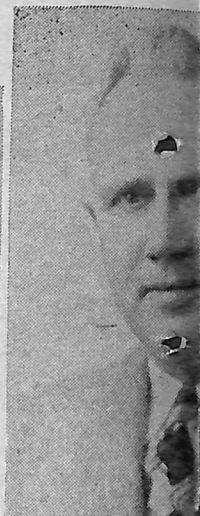
C. F. B. "Little—but"