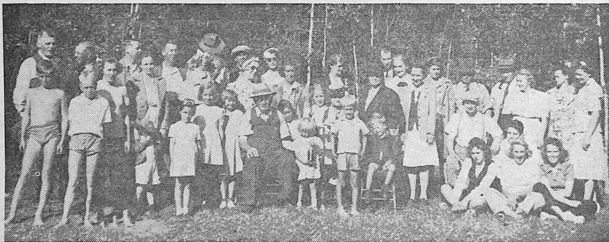
Lodge No. 330