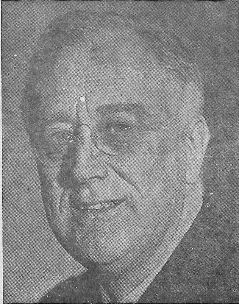
Franklin Delano Roosevelt

He has laid down his burdens. Defeated by death. As a great leader, he lived to see the assurance of victory, but not to share it.