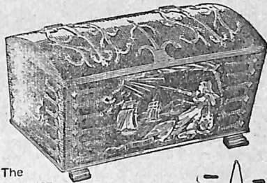
The MOTHER SVEA-CHEST