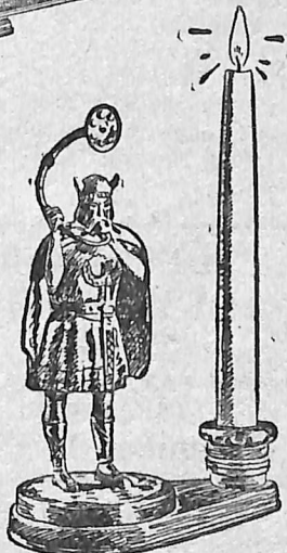
The LURE- PLAYER