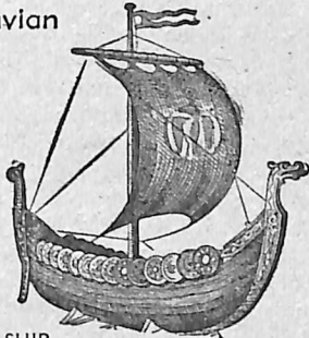
The VIKING SHIP