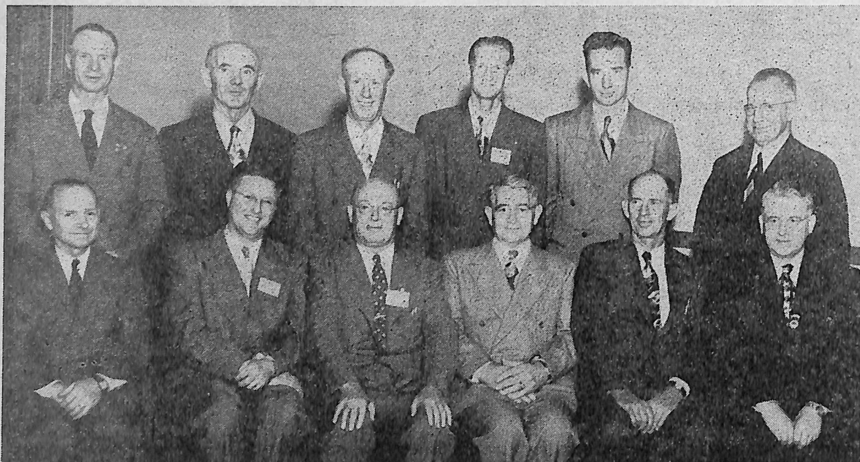
Shown above are the officers selected at the Los Angeles convention together with the two visiting Supreme Officers.

The word is really quite common and is, as so many of our words, taken from the Latin, and means