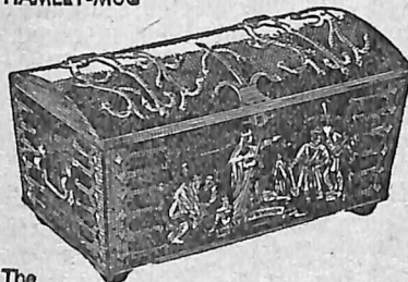
The THYRA DANEBOD-CHEST

The HAMLET-MUG is embossed with two motives from Shakespeares Hamlet-play. It is a nice souvenir, decorative in the home or at the office, can be used for cigars and is an ideal gift to friends. Price $ 9.00.