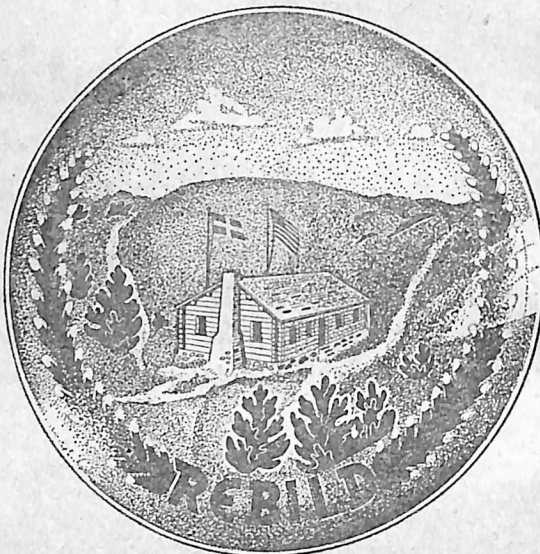
(6 tommer i diameter)