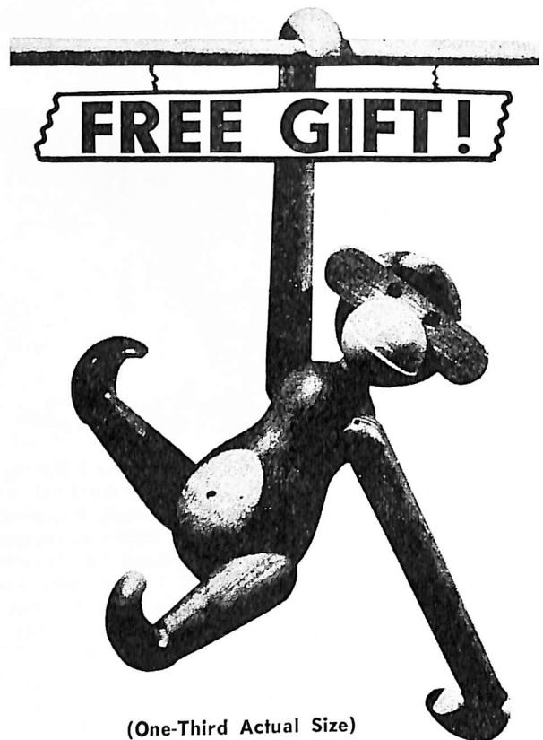
(One-Third Actual Size)

YES — Free to every new junior member! This imported Danish Teakwood monkey. A popular toy for every child, boy or girl.