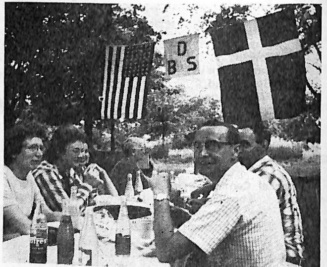
Visitors from Omaha Lodge No. 1 enjoy their visit to the country.