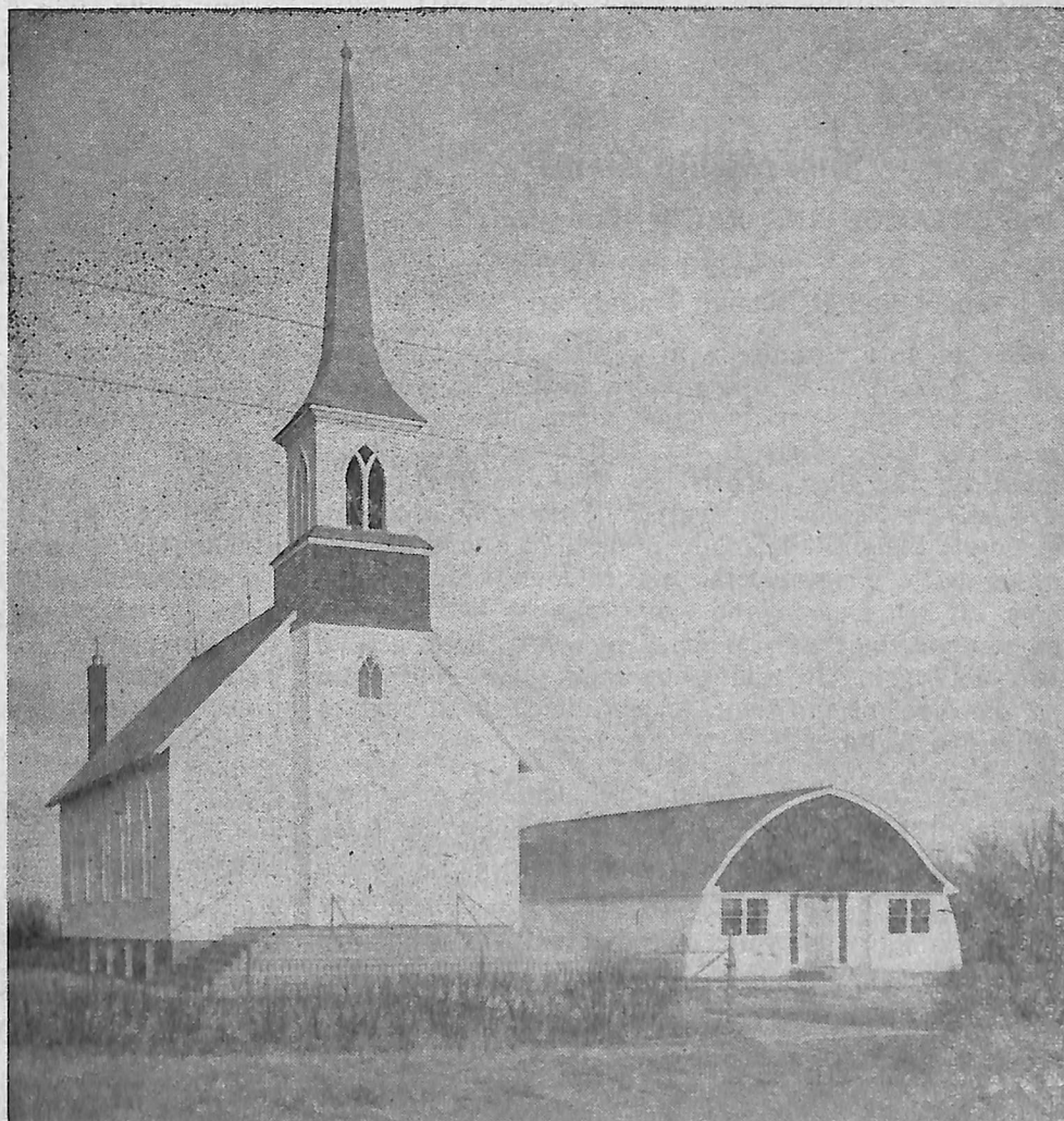
EXTERIOR OF NATHANAEL LUTHERAN CHURCH, DAGMAR, SHOWING THE NEW FELLOWSHIP HALL. THE CHURCH SEATS SEVERAL HUNDREDS.