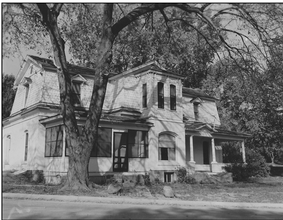
The east-facing Kline House wasn't always painted white. A granddaughter recalls cream-colored brick with designs of red brick at the corners and on the walls.