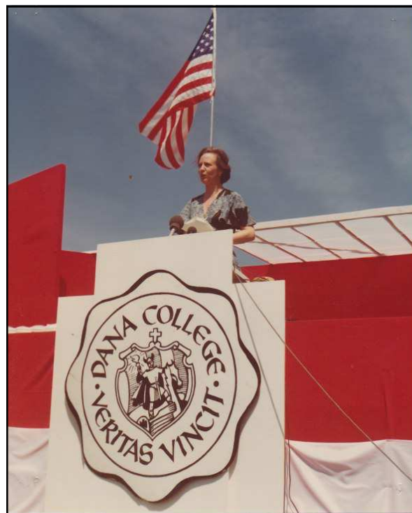
During a tour of the U.S., Queen Margrethe gave her only public address at Dana's Commencement.

And because she had anticipated seeing the Lauritz Melchior