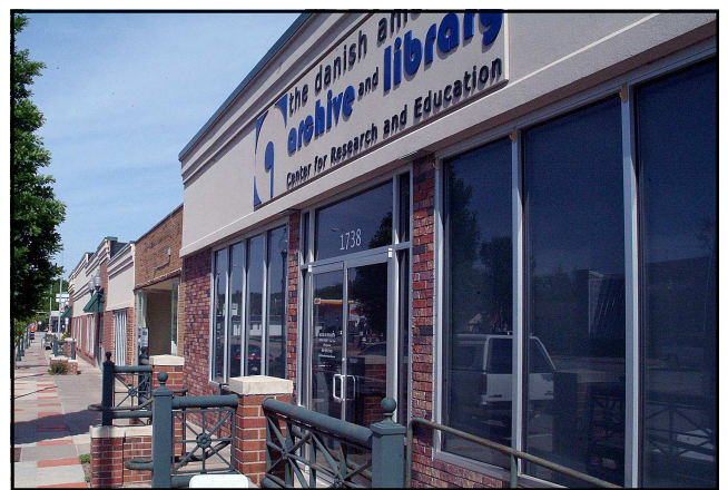
1738 Washington Street, Blair, Nebraska.

For now the staff and volunteers of the DAAL are happy to be at home in our own building! ■