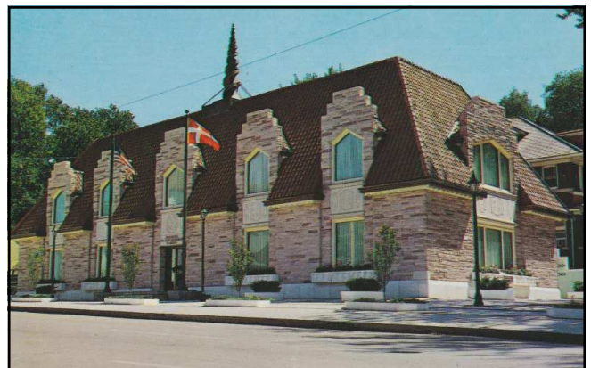
The former headquarters building of the Danish Brotherhood in America.

The building served as law offices from 1994 until 2015, when it was purchased by Security State Bank as future administrative space for Dundee Bank. AO, an Omaha architectural firm, is doing the architectural work on the property and hired Restoration Exchange to write the nomination. You can see the entire nomination document at: landmark.cityofomaha.org/images , then click on National Register. ■