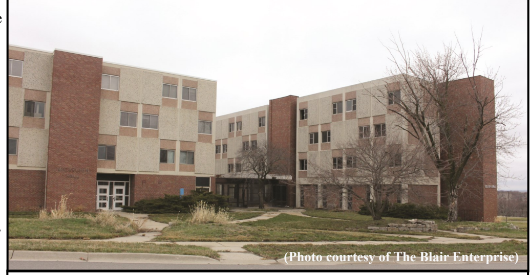
Current view of Blair Hall, right, and Mickelsen Hall, to be converted into studio apartments by May of 2022.

People were afraid of what would become of the campus, and rumors circulated that the campus would become everything from a prison to a shopping mall. But for the first few years, nothing really happened except that the grounds and buildings began to deteriorate, and the campus looked like the abandoned place it was. Both Midland University in Fremont, Nebraska, and Grace University in Omaha considered purchasing the