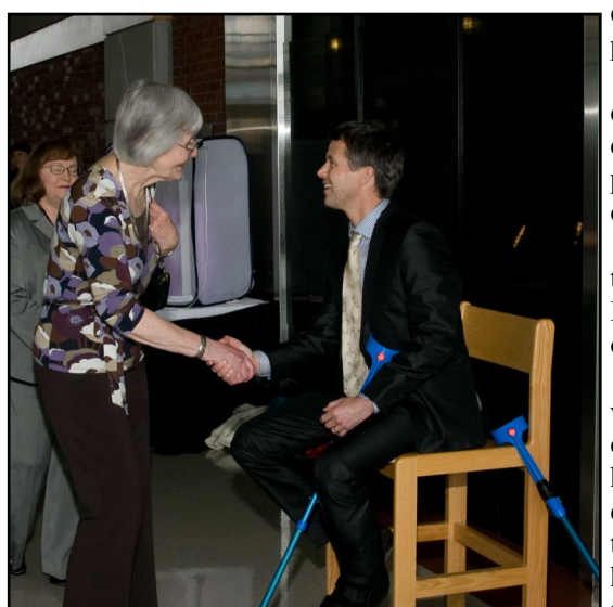
Ann greeting Crown Prince Frederik of Denmark in 2009.