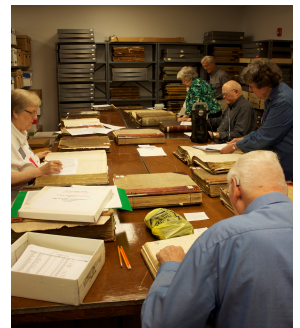
Volunteer week, Oct 2011