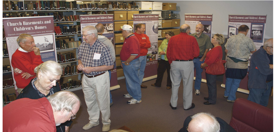
Dana College Alumni Enjoy Kringle Mingle at the Archive Grand-Reopening Event