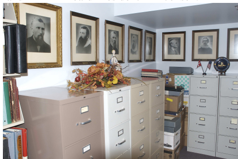
The Dana College room lined with portraits of former Dana presidents.