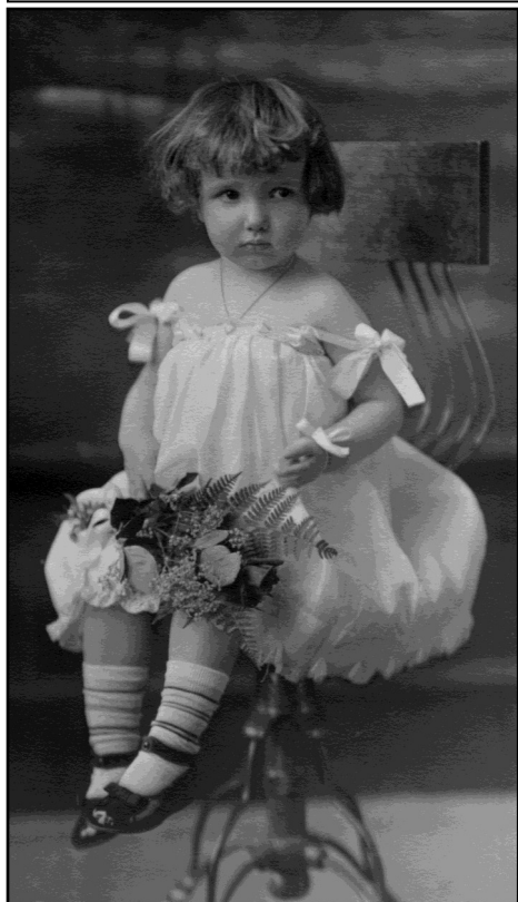
DANES GROWING UP AMERICAN

A publication of the Danish American Archive and Library January—April 2013