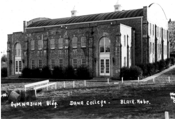
Alumni Memorial Auditorium circa 1940

-- An article in a December 1928 clipping from the Pilot that's headed, "Dana Gymnasium is Being Much